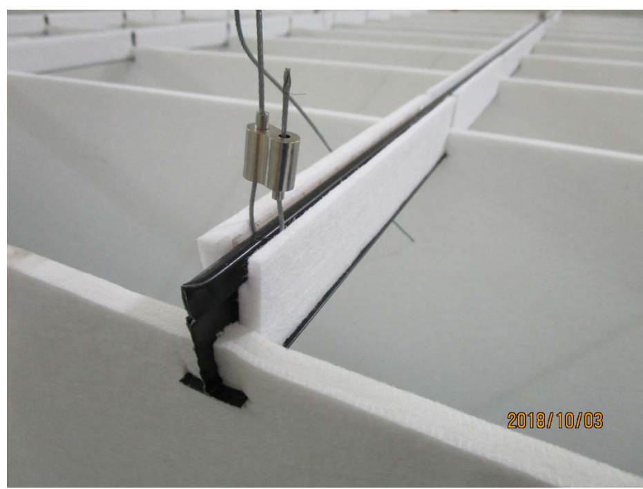
Figure 2 - Detail of baffle material, spacers, mounting method