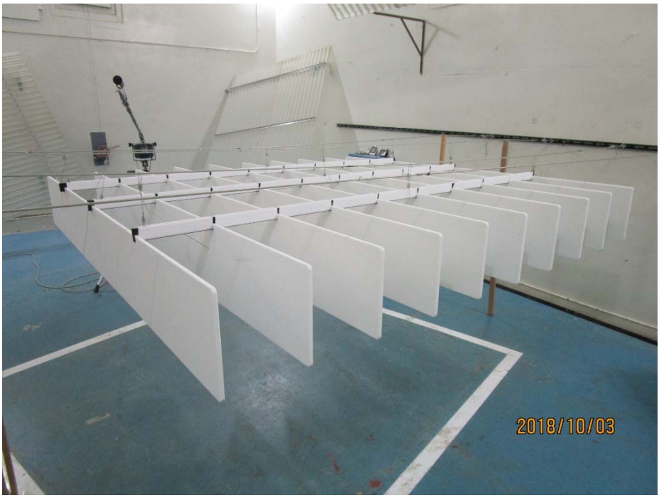
Figure 1 - Specimen mounted in test chamber